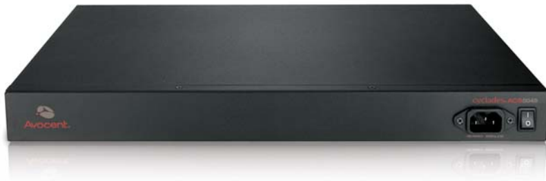
ACS 5048 Advanced Console Server