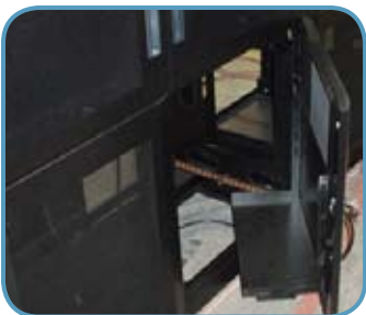
Swing out CPU door