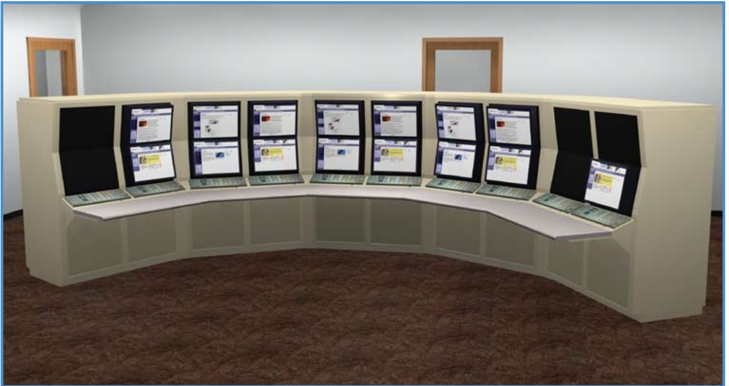
Benchmark is ideal for a variety of specialized applications