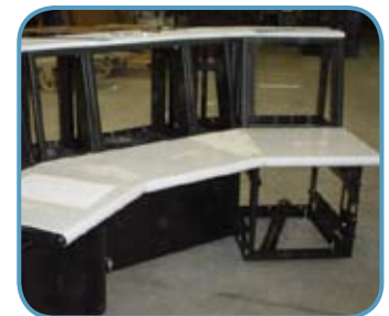
Heavy-duty turret construction provides a rugged console platform and generous technology integration