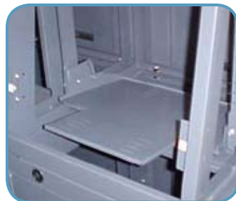
Adjustable monitor shelf in turret unit