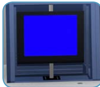
Flat panel display pole mount