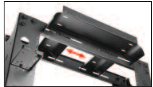
Waterfall cable tray