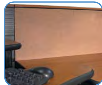
Optional fabric tack panel