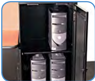
High capacity CPU storage locker