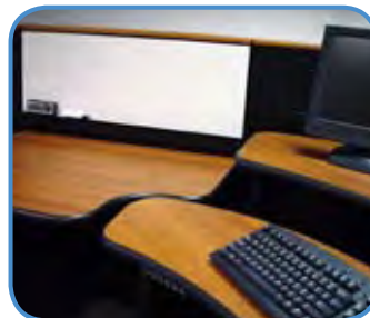
Whiteboard wall insert