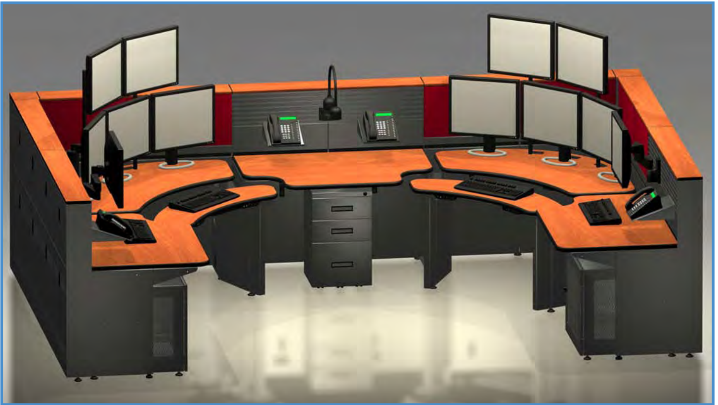
Two-position Contour Advanced configuration featuring dual lift corner worksurfaces