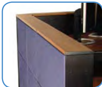
Open office acoustical fabric wraps