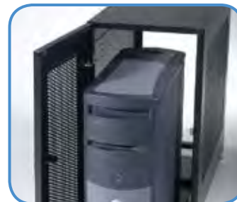
CPU module with retractable service shelf