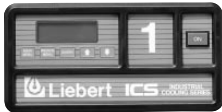
Optional Control/ Monitoring System