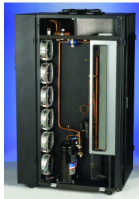
Air Cooled, Self Contained version, With Open Side Panel