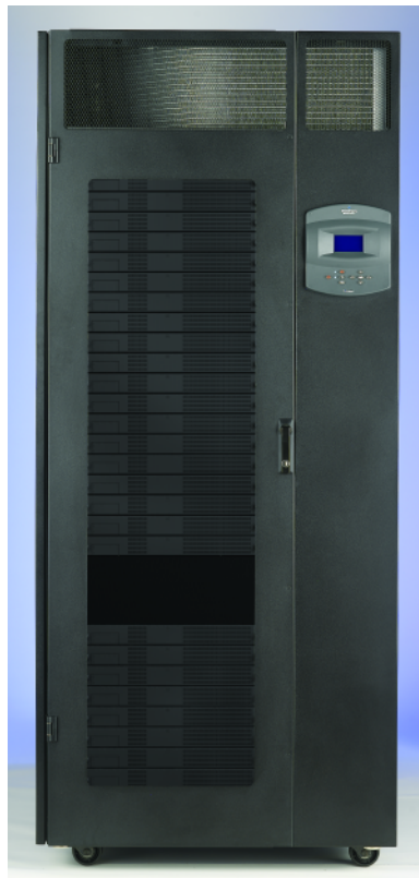
Air Cooled, Self Contained version, Front