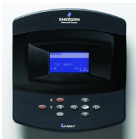
iCOM™ Control Display

iCOM allows for local or remote monitoring of the conditions in the Liebert XDF to protect critical rack components. Options are available for connecting to Liebert remote monitoring devices or for BMS (Building Management System) interface via MODbus or SNMP.