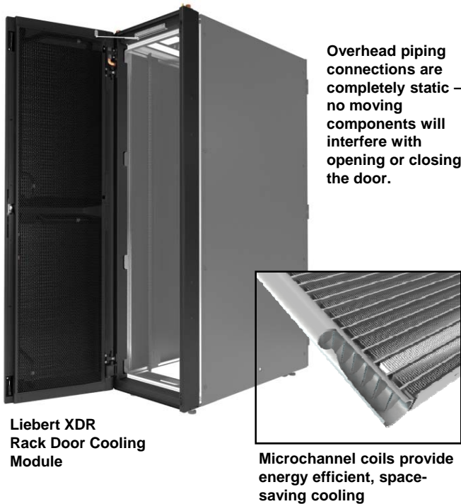
Liebert XDR Rack Door Cooling Module

The Liebert XDR is a fanless heat exchanger module that installs as the rear door of an equipment rack, providing up to 20kW of room-neutral cooling. The Liebert XDR design uses the server fans within the protected rack to provide airflow through the unit. The microchannel coil heat exchanger cools the air and returns it to room at close to the same temperature as the air entering the rack.