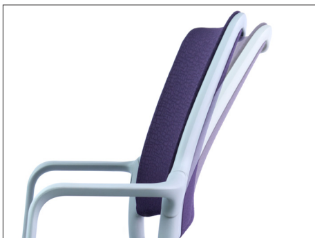
Mode's innovative 12-degree recline ensures a supported sitting experience.