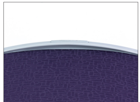
Mode features a seamlessly integrated hand hold for easy handling and a back edge guard to protect its molded cushions.