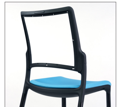
BIFMA certified and pending GREENGUARD certification

Our designers considered the whole product life of banqueting chairs, and realized that product repairs lead to significant environmental impacts. A modular form, Mode was designed to have its legs and cushions easily replaced. As a result, users do not have to send the entire chair back to the manufacturer. Not only does this limit shipping costs and pollution, it also reduces waste. Often, if a chair breaks, the user elects to discard it. Mode encourages users to take a more sustainable approach while optimizing their investment.