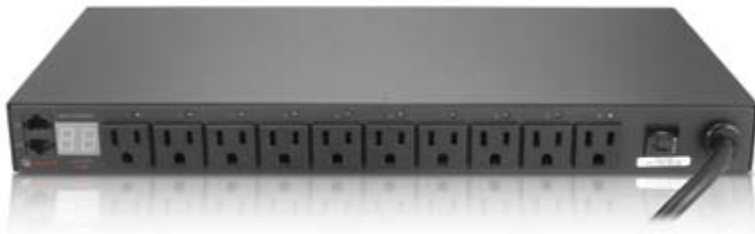
Avocent PM 10 Horizontal PDU

Avocent PM PDUs enable remote power control and system management of IT assets in branch and remote offices. When used in conjunction with Avocent ACS advanced console servers, MergePoint Unity® KVM over IP and serial console switches or DSR® KVM over IP switch appliances, the Avocent PM PDUs offer quick problem resolution through an integrated management interface. With one or more outlets positively associated with a particular device, users may control power “in line” through a user-defined “hot key” or by using an intuitive Web browser-based graphical user interface (GUI). In addition, a special command set facilitates scripting.