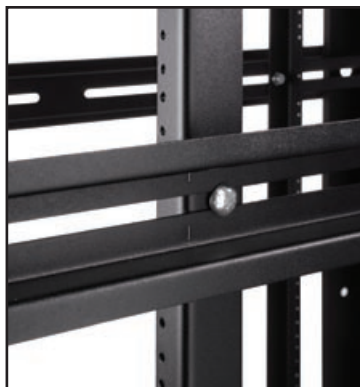
Infinitely adjustable rails