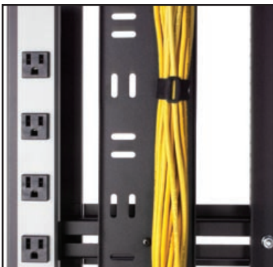
VLB-84 vertical lacing bar