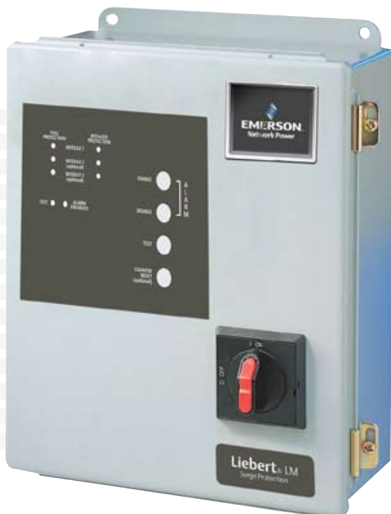
Standard Liebert LM Series (SPD)

The Liebert LM is a surge protective device (SPD) that offers continuous protection from damaging transients and electrical line noise. The Liebert LM utilizes patented circuitry to monitor the status of all protection modes, including neutral to ground. Should protection be unavailable in any mode, the green LED will be extinguished, and the red LED will be illuminated. In addition, high isolation form C dry contacts provide for remote monitoring of suppression system failure, under voltage, and phase and power loss. LM patented suppression integrity monitoring indicates failure for both shorted or opened suppression components.