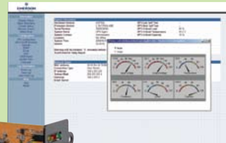
Optional Liebert IntelliSlot Web Card provides SNMP and web-based management