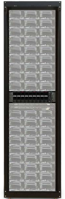
12V DC Rack with NetSure ITS

Centralizing power in the rack allows both main power and backup power to scale at the same rate as the IT load. With this 12V DC integrated rack solution from Vertiv™, IT loads and power are configured to minimize stranded capacity and to size hold up times according to the user's needs. The result is an efficient and economical power strategy that provides ultimate flexibility by enabling IT capacity to be added one rack at a time.