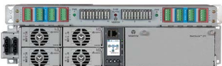
NetSure 211, 2 RU Configuration with Optional GMT Distribution Panel