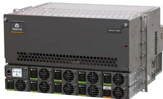
NetSure 5100 with External Distribution