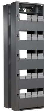
NetSure Battery Rack