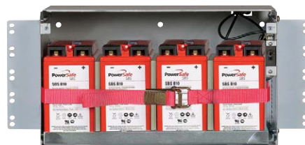
Optional NetSure 211 Battery Cabinet