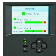
Individual current measurement for each fuse/breaker