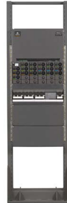
Hybrid NetSure 5100 with 2 Row External Distribution