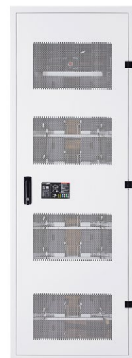
Lithium-ion Battery Cabinets