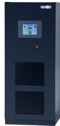
Vycon VDC flywheel system