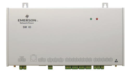
SM IO – EnergyMaster™

The information and alarms, regarding the auxiliary units on a specific site, can be monitored or checked by means of a simple web browser or specific management software. No additional software is needed and the web browser login to monitor the site is password protected. (Examples of alarms provided by means of the control unit of the power system is specified in the datasheet and/or manual for the specific unit.)