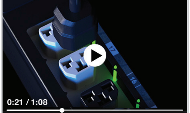
Limitless Possibilities One Standard PDU, the Advanced HDOT<sup>®</sup> Cx