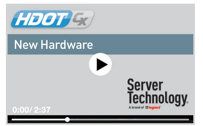
Why HDOT<sup>®</sup> Cx? Part One