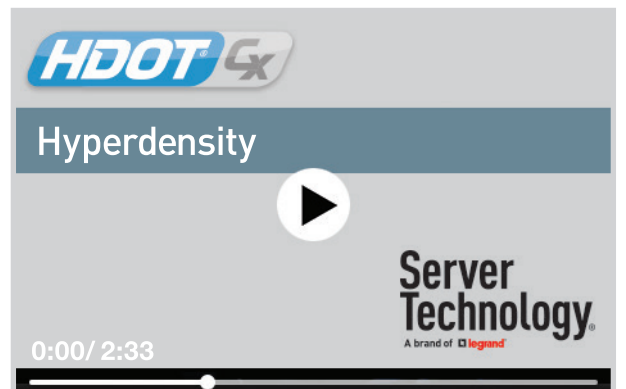
Why HDOT<sup>®</sup> Cx? Part Two