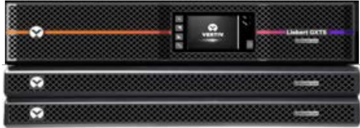
Liebert® GXT5LI 1-3KVA UPS and (2) EBC For Extended Runtime

Lithium-ion technology delivers two to three times the useful life of lead-acid batteries along with a lower total cost of ownership, making the Liebert® GXT5 Lithium-Ion online UPS ideally suited for network and server rooms, and other mission-critical edge applications.